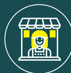
ENTERING THE WORKFORCE