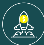
STARTING YOUR OWN BUSINESS