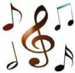
Music Supporters' Group