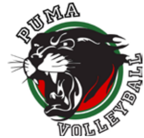
Volleyball Supporters' Group