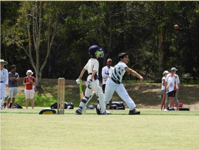
Year 4 Green v Sheldon College on 16 February