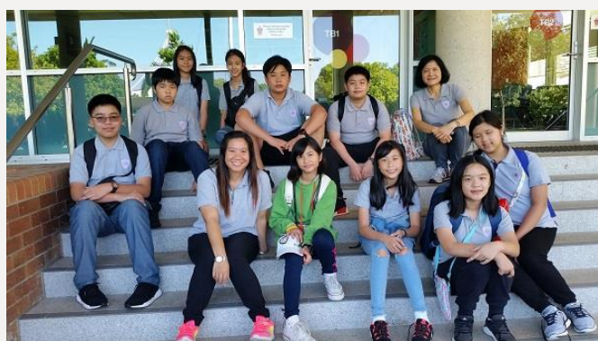
Picture 1 – On arrival – Thai teachers and students Picture 2 – Students ready for class

St Paul's School is very pleased to enjoy a close relationship with the Amnuay Silpa School, a co-educational private school in Bangkok, Thailand which was founded in 1926. For over ten years now, students from Amnuay Silpa School have visited SPS each year to complete a Joint Program. This involves a full immersion experience in main school classes for these visiting students. This year, the ten Thai students are integrating into classes in Year 8 and Year 9. The Thai students are accompanied by two of their teachers who are also here to experience what an Aussie education is like. They follow a program of class observations across the school with a particular focus on how we are preparing students for the 21st Century through our unique Realms of Thinking.