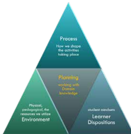
Initial Common Realm Learning Framework diagram